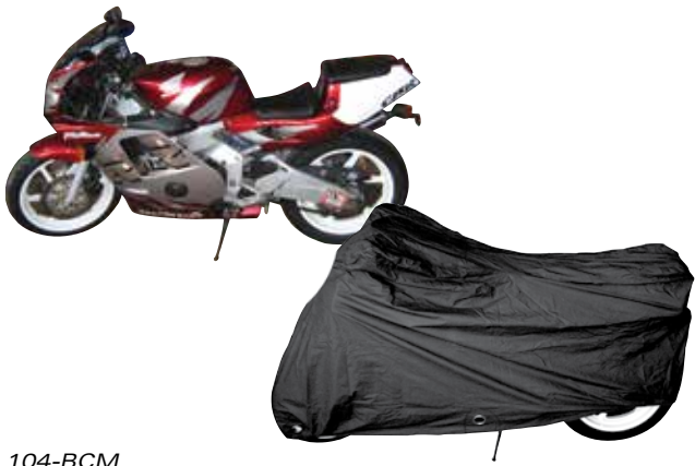
104-BCM MEDIUM BIKE COVER - SUITS 250'S WET COVER - WATERPROOF, FULL SYNTHETIC