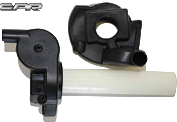
168-TAMX UNIVERSAL THROTTLE ASSEMBLY VORTEX STYLE SUITS KX/YZ/RM