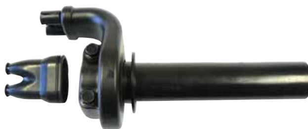
168-TADC UNIVERSAL THROTTLE ASSEMBLY DUAL CABLE ALSO SUITS KTM 250/450 '05-'08 STYLE