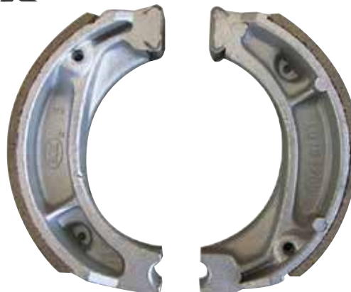
BRAKE SHOES 100-CS713 CS15 CP330 (VB142) F713