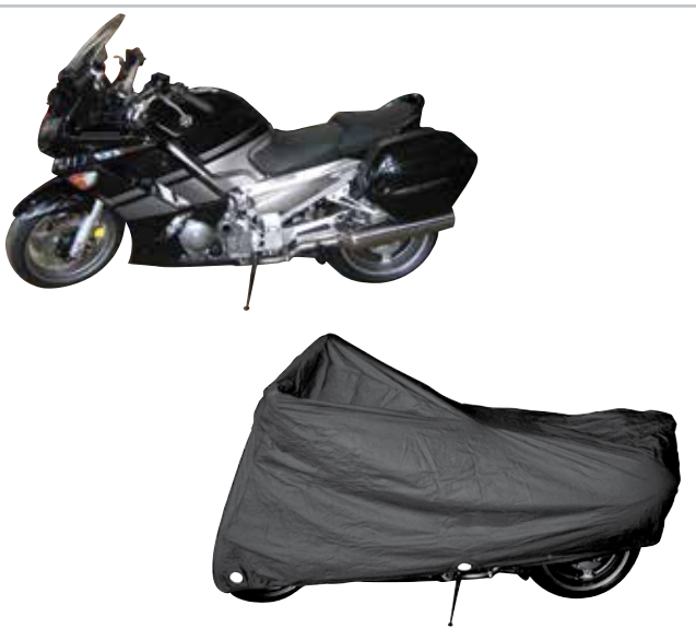
104-BCX X LARGE BIKE COVER SUITS LARGER SPORTS/TOUR/ CRUISERS WET COVER - WATERPROOF, FULL SYNTHETIC