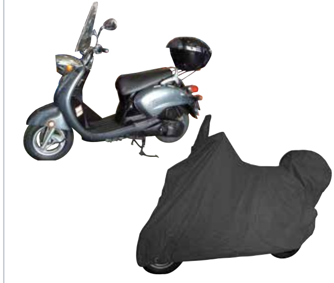
104-BCSD DELUXE SCOOTER BIKE COVER SUITS MOST SCOOTERS, SCREEN & TOP BOX (ZIPS OUT) WET COVER - WATERPROOF, FULL SYNTHETIC