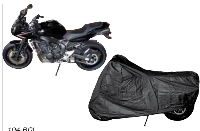
104-BCL LARGE BIKE COVER SUITS 600-750 SPORTS WET COVER - WATERPROOF, FULL SYNTHETIC