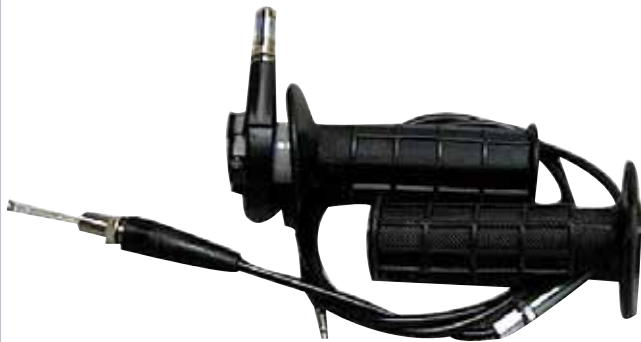
168-TAXL HONDA XL THROTTLE ASSEMBLY STRAIGHT PULL WITH CABLE UNIVERSAL FIT