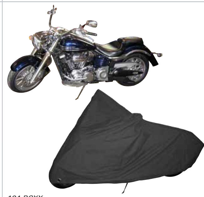
104-BCXX XX LARGE BIKE COVER - SUITS FULL DRESS CRUISERS WET COVER - WATERPROOF, FULL SYNTHETIC