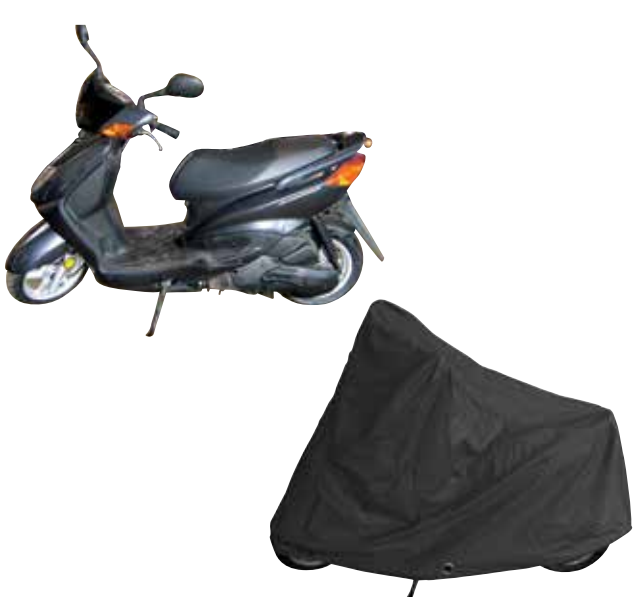
104-BCSS STANDARD SCOOTER BIKE COVER WET COVER - WATERPROOF, FULL SYNTHETIC