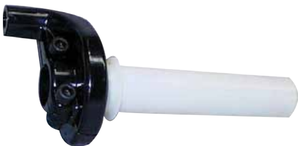
168-TACR HONDA CR THROTTLE ASSEMBLY SIDE PULL FAST ACTION UNIVERSAL FIT