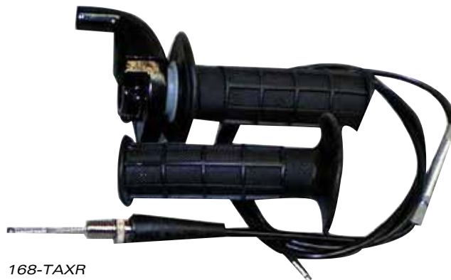
168-TAXR HONDA XR THROTTLE ASSEMBLY SIDE PULL WITH CABLE UNIVERSAL FIT